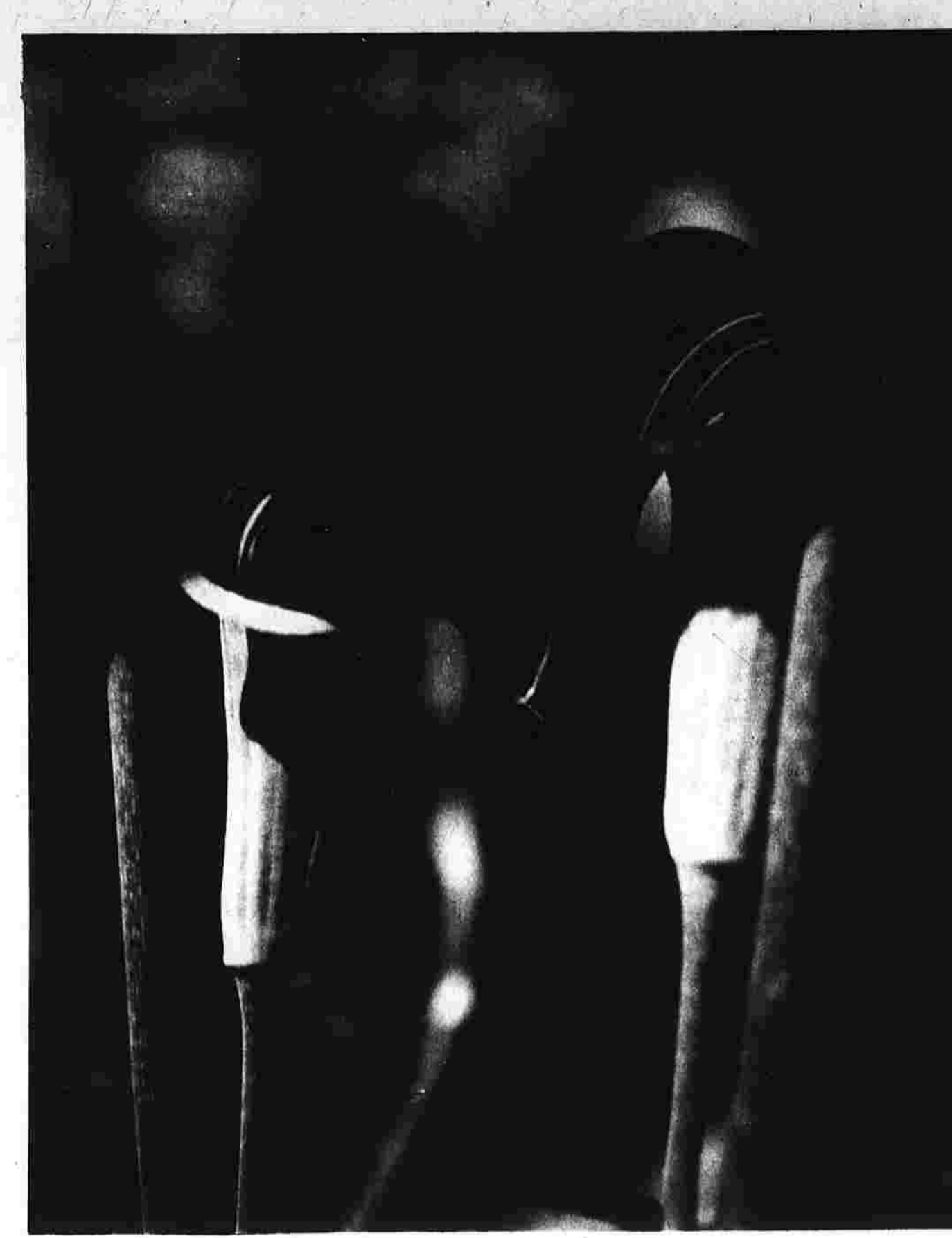
Nature Study By Sylvian Oltan

Perhaps we need to touch bottom and touch base and begin to fight for ourselves there we treat ourselves to tonic hope and illusions.