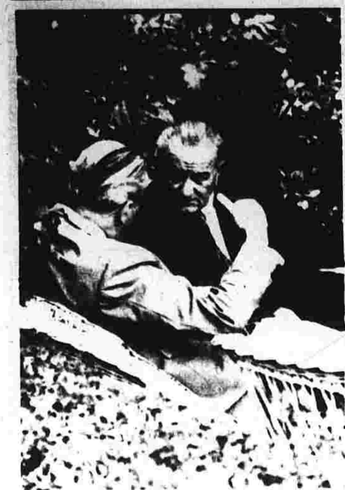
In a Wooded Glen President Johnson and West German Chancellor Kurt Kiesinger get together today in a wooded setting at the Kennedy Center in Washington. They conferred in the outdoor setting during a second round of talks.