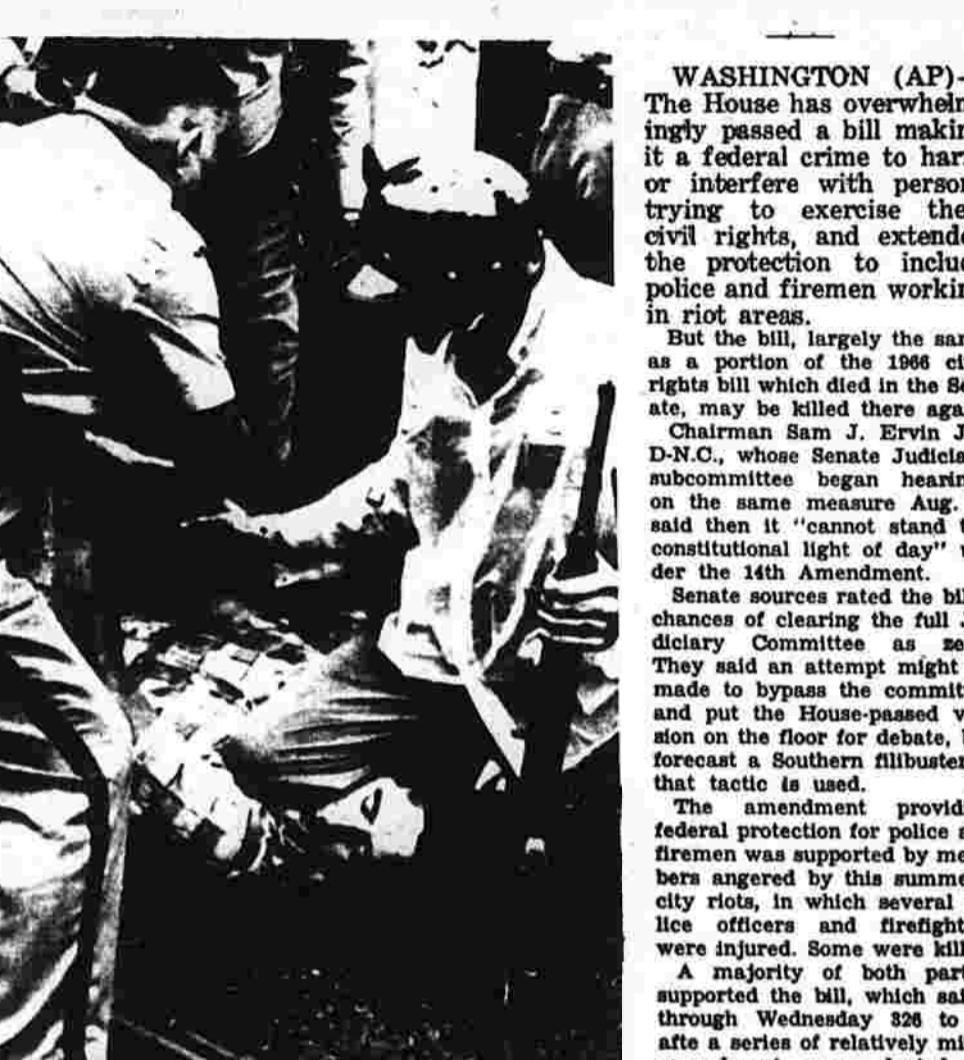
A Louisiana state trooper puts a knee into the chin of a white man while another applicant handcuffs after a group of 75 whites attacked a group of 25 Negro civil rights workers Wednesday at Satsuma, La.