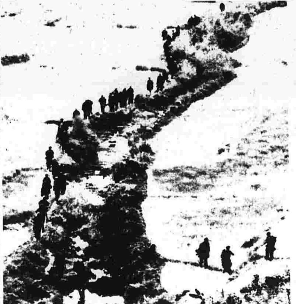
U.S. Marines string out along a crooked path bordering rice fields as they set out on an operation 25 miles south of Da Nang in the northern coastal plain of South Vietnam.